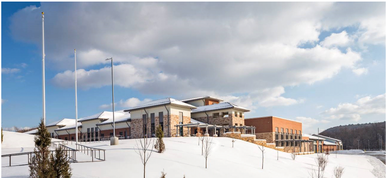
Project: Newtown Armed Forces Reserve Center at Danbury, Connecticut D/B RFP Preparer: RSP Architects